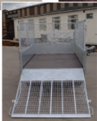
High ramp door

NOTE: You should always check your vehicle manual for your legal towing capacity.