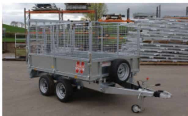
Wiremesh extension sides