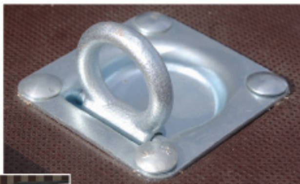
Internal lashing rings